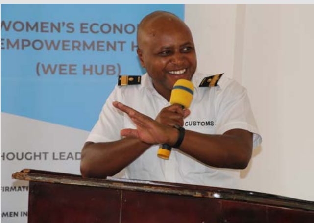
Busia border point Customs representative presents at the dissemination exercise

Women informal cross-border traders face disproportionate challenges as compared to their male counterparts. According to a study report released by the University of Nairobi Women's Economic Empowerment Hub (UoN WEE Hub) during a stakeholders' workshop held on December 13th and 14th, 2022 at Farmview Hotel in Busia County, these women form 70% of cross-border traders in Busia County.