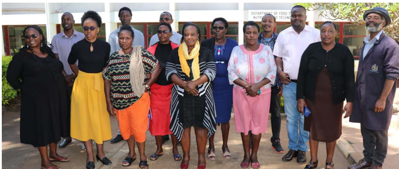
Maono Mothers' Women Group pose for a photo after a training session

Leaders of the Maono Mothers' Self-Help Group from Nyandarua successfully completed a four-day training on Best Practices in Potato Processing. The University of Nairobi (UoN) Women's Economic Empowerment (WEE) Hub conducted the training in partnership with the Department of Environmental and Biosystems Engineering at the Upper Kabete Campus of the UoN from January 11 to 13, 2023.