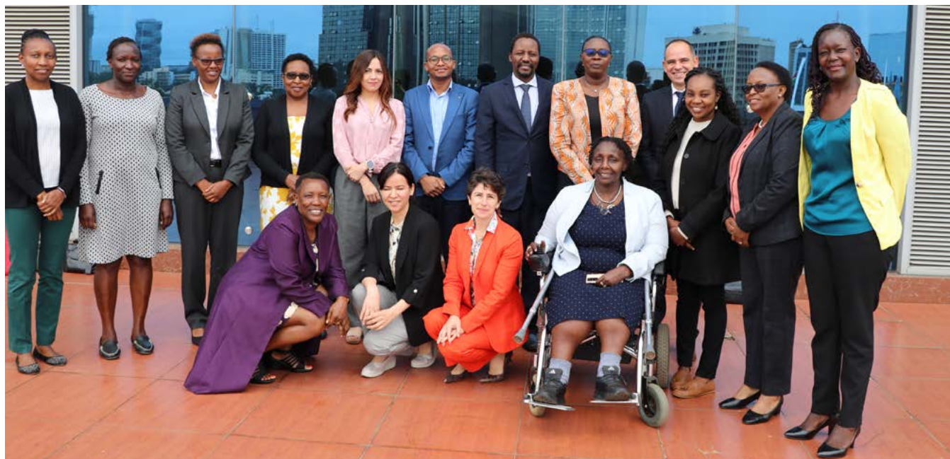
UoN and KU WEE Hubs after the World Bank Mission on CGS meeting held at the University of Nairobi.

The World Bank Group invited the University of Nairobi (UoN) Women's Economic Empowerment (WEE) Hub to participate in its mission to support the Credit Guarantee Scheme for MSMEs by backing the "Supporting Access to Finance and Enterprise Recovery (SAFER)" Project.