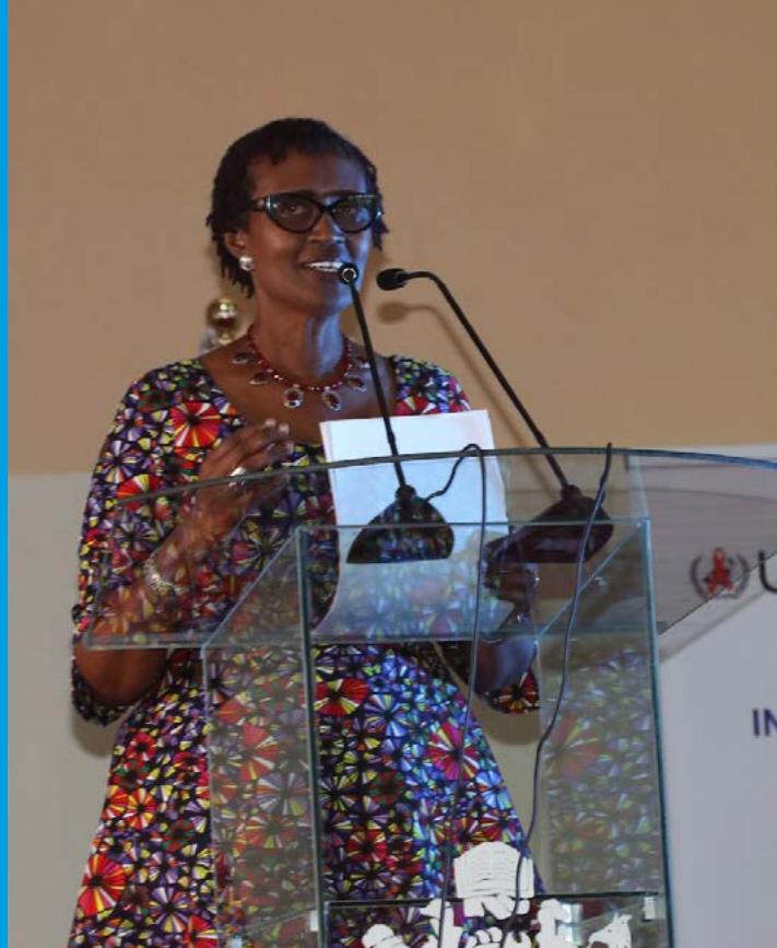
Ms. Byanyima addresses the audience during the Public Lecture

Secondly, she pointed out inequalities in the Global Financial System which allow African governments minimal loan financing despite being burdened by debt. In fact, more than 50 percent of African countries today are either in debt distress or at considerable risk of falling into debt distress. They have no reserves to deal with