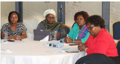
UoN WEE Hub team at a workshop to evaluate the dissemination exercise through KBC