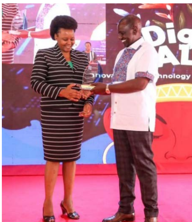
WEE Hub Presidential Award

Under the category of Financial Inclusion H. E. President Dr William Ruto on 2nd March 2023 awarded the University of Nairobi Women's Economic Empowerment Hub in recognition of its contribution towards economic and financial inclusion for women and girls through innovation and technology.