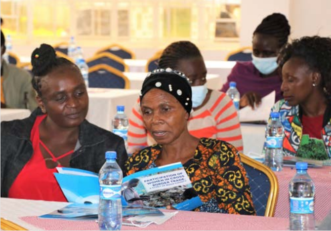
A woman trader/beneficiary of the childcare facility peruses the research report during the dissemination exercise

with the Kenya National Bureau of Statistics (KNBS) with a view to investigate participation of women in cross-border trade and identify the challenges they face. The study findings were shared during a two-day dissemination workshop convened by the WEE Hub and attended by national and local stakeholders. The study reported that 66% of the businesswomen fail to open their business on time in the morning or have to close earlier than they should so as to deal with care work. On the other hand, 51% were unable to trade at far away markets, 36% were unable to participate in community and business activities, while 67% reported that lack of childcare significantly affected their profits, yet informal cross-border trade contributes to approximately 40% of GDP in African countries with women being the majority.