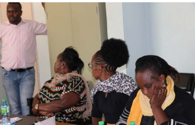
The women interact with the trainer before the practical session

The participants were exposed to a variety of potato products such as whole peeled potatoes, wedges, chips (French fries), fortified flour, soup powder and mashed starch which add value to the potatoes and ensure better price. The trainees were also informed of available markets; entry requirements; as well as quality standards and opportunities for financing.