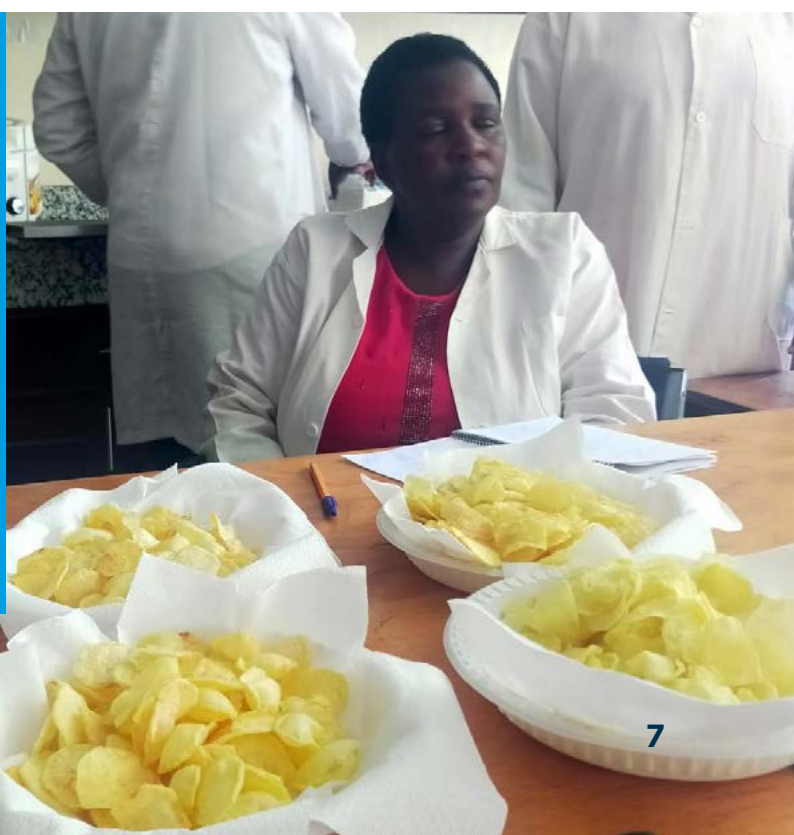
A trainee displays potato crisps produced during the training

“To ensure sustainability, these leaders will train others within the community on the application of the technologies learnt for replication.”