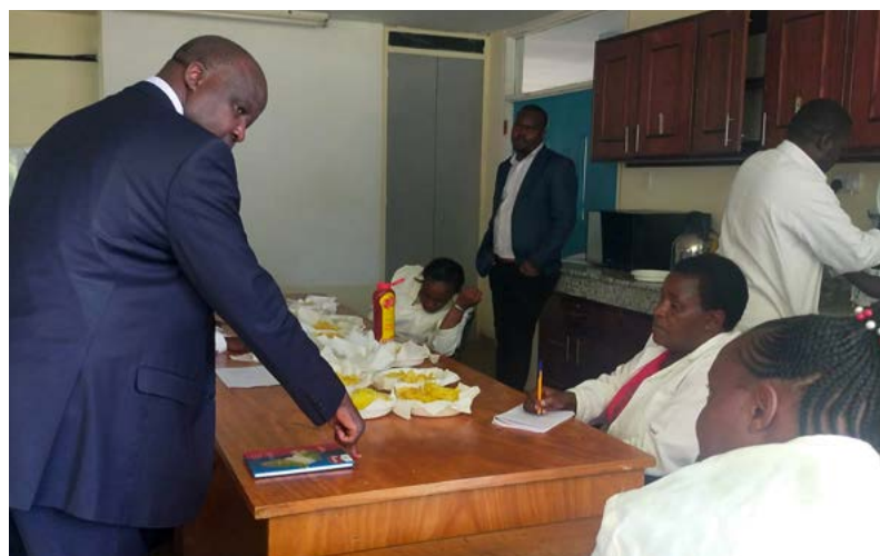
A trainer in a follow up discussion after the practical session

Here is what the participants felt about their training: “I tried to package crisps manually but after a few days they would start getting moisture