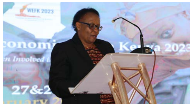
WEE Hub, Director Research delivers a speech during Women's Economic Forum 2023

This year's Women's Economic Forum, Kenya was held on 27th and 28th February and brought together a host of stakeholders from various fields such as research, finance, manufacturing, agriculture, and technology. The participants discussed how strengths from these sectors can be harnessed to achieve the goal captured in the theme of the event: 'Getting Women Involved in Kenya's Economic Recovery.' The event provided an opportunity for participants from these sectors to explore the potential of new and improved partnerships.