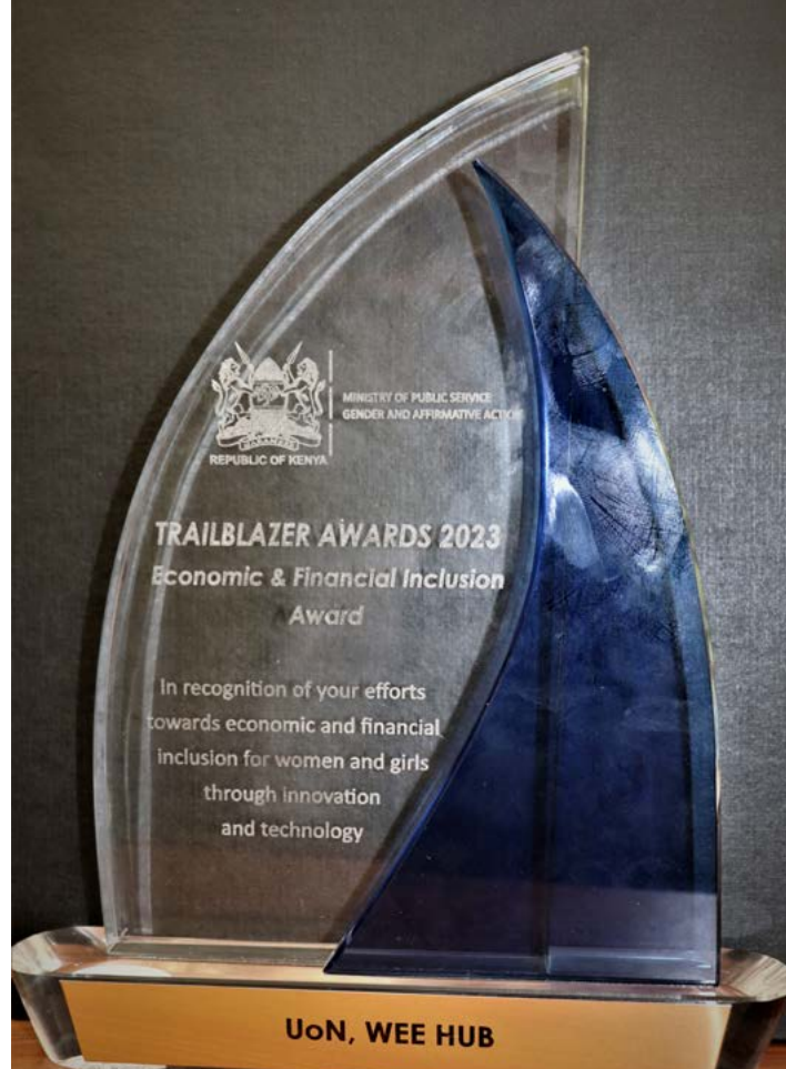
The IWD Award

The UON WEE Hub, a program of the African Women's Study Centre at the Faculty of Arts was recognized and awarded for its efforts towards women's financial inclusion under the category Economic and Financial Inclusion for Women and Girls through Innovation and Technology .